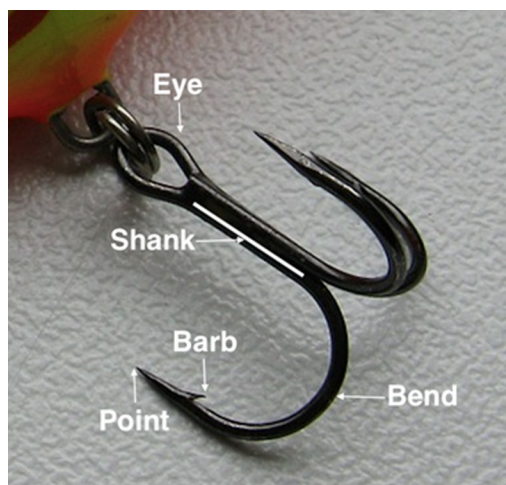
Figure 1. Diagram of a three-pronged, barbed fish hook.

Open-globe injuries (OGIs) are an uncommon but debilitating form of injury, with the potential to cause significant ocular morbidity. 1 OGIs are estimated to affect 3.8 per 100,000 individuals in the United States annually. 2 One rare cause of OGI is fish hook-related trauma. Fish hook OGIs are challenging to repair surgically because of the pointed barb, designed to lodge in the flesh of the fish. This barb prevents easy removal of the hook from tissue through the entry wound and ensures that the hook can only travel forward, lodging itself deeper into impaled tissues (see Figure 1). The advance-and-cut method is the most commonly reported approach to remove intraocular barbed fish hooks. The technique involves pushing the hook through a surgical incision to the exterior of the globe, clipping the barb, and removing the shank of the hook backward through the entry wound. 3 Though effective, the technique has disadvantages, including the creation of an additional wound site, the requirement for wire cutters, and the potential for additional iatrogenic injury due to globe manipulation during wire cutting. Alternatively, the back-out method