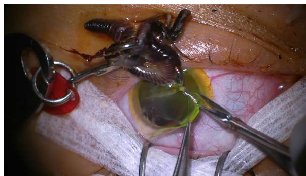
Video 1. Overview of the key surgical points during the extraction of an intraocular fish hook for case 1. Briefly, a partial thickness cut was made into the anterior stroma overlying the fish hook, which was then backed out carefully from the cornea and removed. A single 10-0 nylon suture closed the exit wound temporarily, and fluorescein dye confirmed a watertight seal.

A paracentesis was made at 10 o'clock, and the anterior chamber was inflated with sodium hyaluronate. Using a 15° blade, a partial thickness cut was made in the anterior stroma overlying the fish hook, in the same axis as the barb, traversing the entire length of the embedded hook. Using a cyclodialysis spatula to evert the edges of