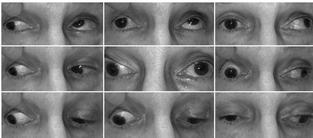
Figure 1. Ocular motility testing demonstrating impaired adduction, supraduction, and infraduction of the right eye. Left eye motility was full.