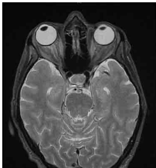
Figure 2. T2-weighted magnetic resonance imaging demonstrating mild right-sided proptosis and slightly increased cerebrospinal fluid signal surrounding the right optic nerve but no abnormal enhancement and no mass or retrobulbar inflammation.

patient's ophthalmic signs and symptoms, including diplopia, ptosis, and misalignment resolved 1 month after initiation of intrathecal chemotherapy. This coincided with the dissipation of myeloid blasts from the CSF. She has experienced no ophthalmic symptoms in the ensuing 8 months.