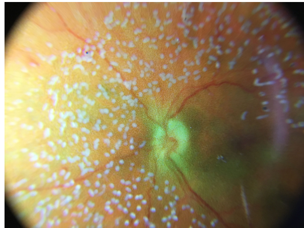
Figure 2. Printed fundus following laser panretinal photocoagulation with the constructed eye model.

Video 1 demonstrates the step-by-step construction of the eye model.