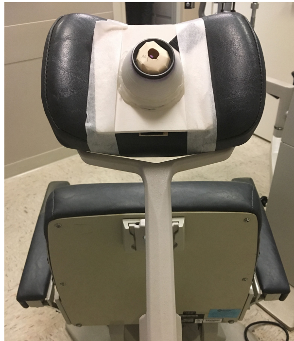
Figure 3. Set-up of the eye model in a typical office setting prior to laser photocoagulation.

One of the keys to our model is the use of a 60 D lens as the optical component (which mimics the dioptric power of the human eye). This high-quality lens, or the similar 78 or 66 D lens, is owned by most residents and there-