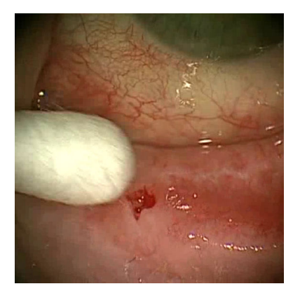
Video 1. Demonstration of the operative steps of the technique for suture-assisted punctoplasty.

An ideal punctoplasty procedure achieves a large enough punctum with minimal disruption of anatomy and also reduces the risk of restenosis.<sup>4,5</sup> Although the punctoplasty is a relatively simple surgical procedure, there is a considerable variation in the surgical techniques described to perform a punctoplasty; these include