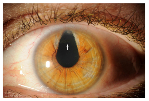
Figure 4. Slit-lamp photograph of the left eye showing a large sectoral surgical iridectomy exposing the edge of the Visian ICL (white arrow). McCaughey and colleagues. Reprinted with permission

To date, over 400,000 Visian implantable collamer lenses (STAAR surgical, Monrovia, CA) have been used to correct refractive error.<sup>6</sup> With careful patient selection and judicious surgical technique, the procedure is considered relatively safe. However, devastating complications, including pupillary block glaucoma, can occur. McCaughey and colleagues<sup>6</sup> present the case of a 44year-old highly myopic woman who underwent bilateral implantation of a Visian implantable collamer lens (ICL) and suffered consecutive iatrogenic pupillary block. Preoperatively, a single laser peripheral iridectomy was performed in each eye. Three hours postoperatively, the patient was in pupillary block in her right eye, likely due to use of an oversized ICL. On postoperative day 1 she was found to have corneal edema, with synechiae to the ICL. She underwent surgical synechiolysis with iris and lens repositioning (Figure 3; taken approximately 4 months postoperatively). Two weeks later, she developed pupillary block in her left eye due to a nonpatent iridotomy and underwent unsuccessful laser followed by successful surgical peripheral iridectomy (Figure 4; taken approximately 4 months postoperatively).