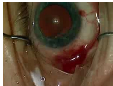
Video 1. Video showing the paracentesis followed by spontaneous iris bleeding, injection of hyaluronic acid, cessation of bleeding, clear corneal incision, removal of blood-tainted viscoelastic, and refilling of the chamber with hyaluronic acid without rebleed.

The low platelet count of 75,000/ \mu L in our patient with CLL may have triggered spontaneous bleeding from