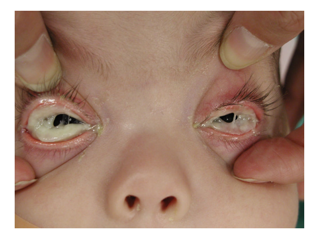
Figure 1. Thick, woody discharge overlying conjunctiva in both eyes.

A 6-week-old non-Hispanic white boy presented to the Neonatal Intensive Care team of Tulane University Medical Center with a 3-week history of yellow-grey discharge from both eyes; he was otherwise in no distress. He was born by normal vaginal delivery at 37 weeks gestational age after an uneventful pregnancy. He was in the care of foster parents, and the medical history of his biological parents was unknown. There was no other ocular history. He had no known allergies, and his immunizations were up-to-date. He had pulmonary hypertension, a patent ductus arteriosa, and had undergone repair of a diaphragmatic hernia at 1 week of age. For 4 days prior to presentation, he had been administered erythromycin elixir, 400 mg orally four times daily, without improvement in ocular discharge.