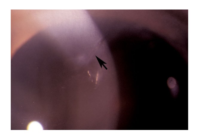
Figure 1. Left eye showing corneal stromal scar (arrow).

A rare case of delamination and replication of the anterior lens capsule into prominent floating folds in the anterior chamber approximately 55 years after a penetrating injury to the eye and anterior lens capsule is reported. Classically, true exfoliation of the anterior lens capsule has been reported in individuals who have been exposed to intense heat over a prolonged period. However, more recently cases of true exfoliation of the anterior lens capsule have been reported in patients who have not been occupationally exposed to high temperatures and associated infrared radiation. A brief review of the literature concerning true exfoliation of the lens capsule in the absence of intense heat exposure is included. Associations with trauma, inflammation, advanced age, hyperopia, glaucoma, and capsular protein abnormality have been reported, but the pathogenesis of this rare clinical finding remains conjectural.