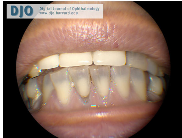
Figure 4. Bluish discoloration of the patient's teeth and gums.