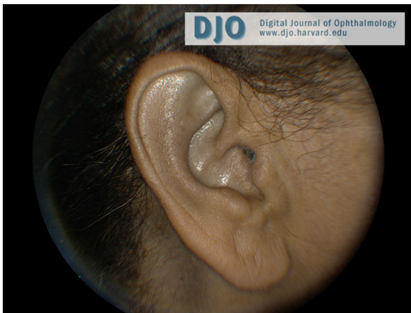
Figure 3. Bluish discoloration of the patient's left ear.