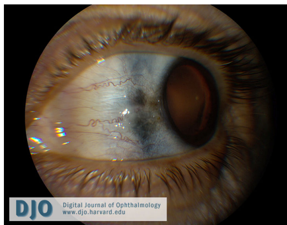
Figure 1. Left eye with bluish-gray scleral hyperpigmentation nasally.

On examination, the patient's visual acuity was 20/25 bilaterally. Her pupillary examination, intraocular pressures, extraocular movements, and confrontational visual fields were all normal. She had dark-brown and blue discoloration of the sclera circumferentially approximately 4 mm posterior to the limbus bilaterally, most concentrated nasally and temporally (Figures 1 and 2). There was no scleral thinning or injection. Her corneas were clear with no keratic precipitates. The anterior chambers were quiet. Her lenses, vitreous, and retinae were unremarkable, with no evidence of vasculitis, uveal tumors, or intraocular inflammation. Closer inspection of the patient's face revealed bluish discoloration of the lateral canthi and lower eyelid skin bilaterally, the pinna of both ears, and her front teeth (Figures 3 and 4). Her